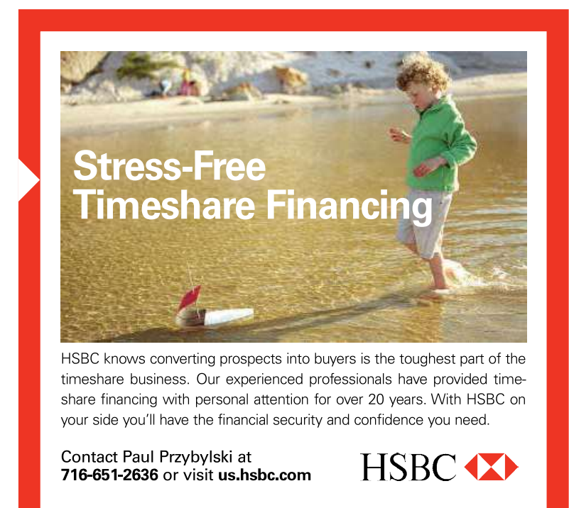
Issued by HSBC Mortgage Corporation (USA)

In collaboration with partner, MMG Worldwide, a $100 million full-service global advertising and marketing firm with more than 25 years experience in the travel, hospitality and entertainment industries, we built TourismROI.com. At its core, TourismROI is a global B2B information and networking service for more than 12,000 tourism destinations around the world, powered by Ektron CMS400.NET software. This unique technology will expand the opportunities for many on both sides of development-on one, investors and entrepreneurs seeking business opportunities and on the other, public and private entities looking to attract partners for development. TourismROI